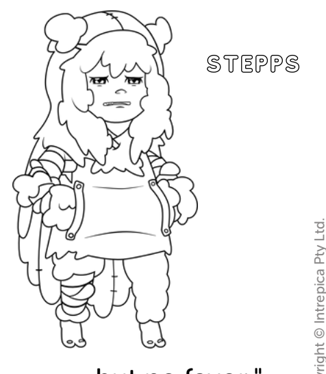
... but no favor."