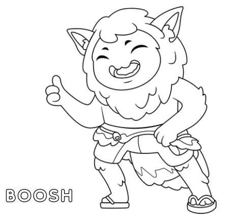
you crossed the mighty Boosh!"