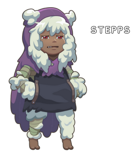
... but no favor."