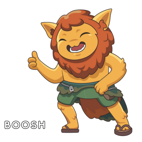
you crossed the mighty Boosh!"