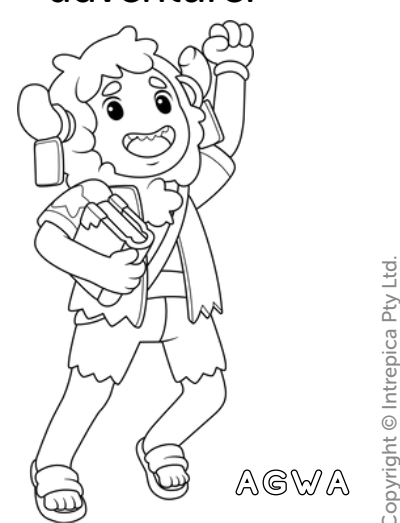
"You have my apologies...